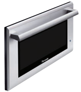
WDF30ES Stainless Steel with Masterpiece handle