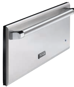
WDF30EP Stainless Steel with Professional handle

Telescopic rails feature a telescoping, ball-bearing design for smooth opening and closing that supports up to 55 lbs