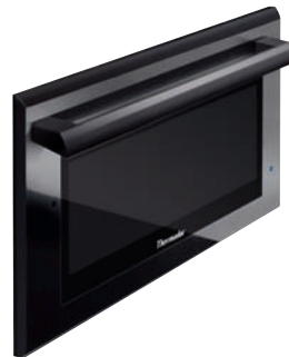
WDF30EB Black with Masterpiece handle