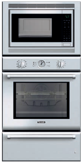
Professional Series stainless steel microwave/warming drawer triple combination oven.