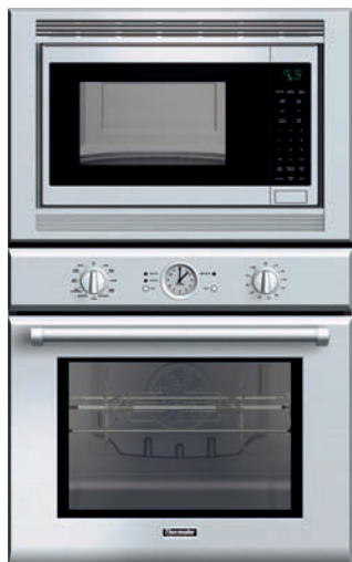
Professional Series stainless steel microwave double combination oven.