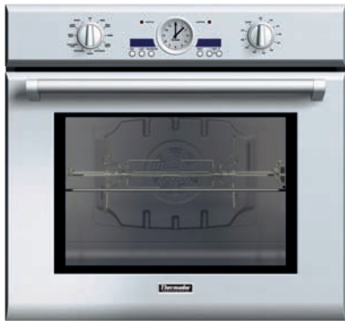
Professional Series Deluxe stainless steel single oven with electronic display and True Convection.