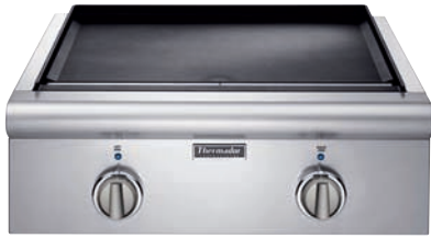
Titanium-surface electric griddle Also available on PCD484EE cooktop and PRD484EE Pro Grand® range.