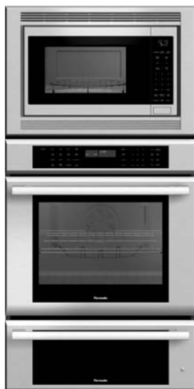
Masterpiece Series stainless steel combination oven with microwave, True Convection oven and warming drawer.