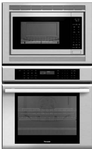
Masterpiece Series stainless steel combination with a microwave and True Convection oven.