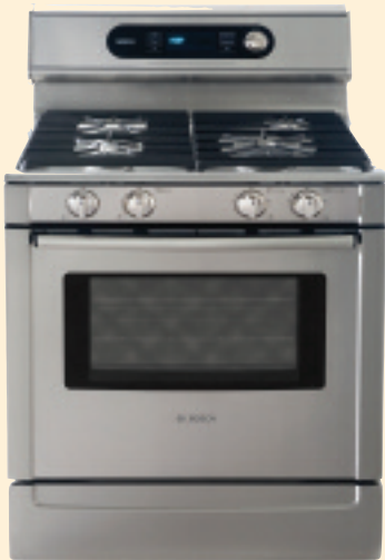
HGS7282UC PRO Gas Range