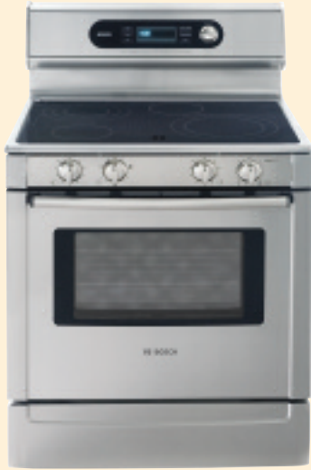
HES7282U PRO Electric Range