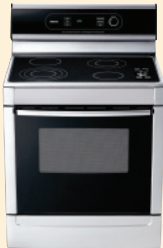
HES7252U Electric Range