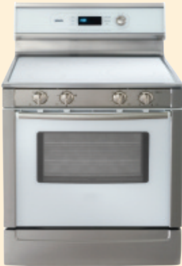
HES7132U PRO Electric Range