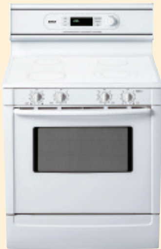
700 Series HES 70(2,5,6)2 (U or C) Electric Range