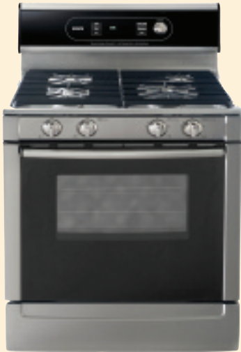
HDS7152U Dual-Fuel Range