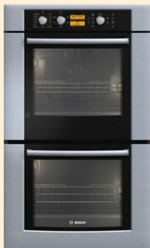
HBN5650UC Double Oven