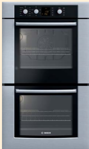
HBL3550UC Double Oven