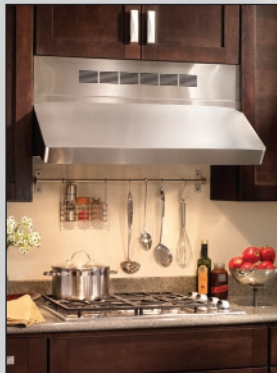
Optional non-ducted recirculation kit for use with internal blower models.

Heat Sentry™ is a smart feature that detects excessive heat and adjusts speed to high automatically